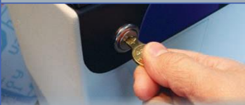
BYPASS MODE WITH LIMIT