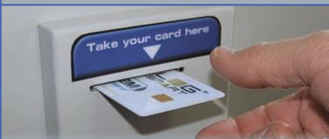
U-SMART CARD DISPENSER