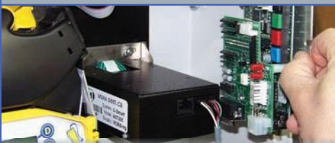
EASY TO SERVICE