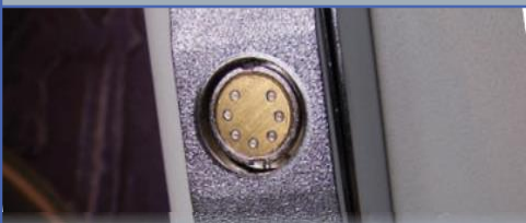
HIGH SECURITY LOCK