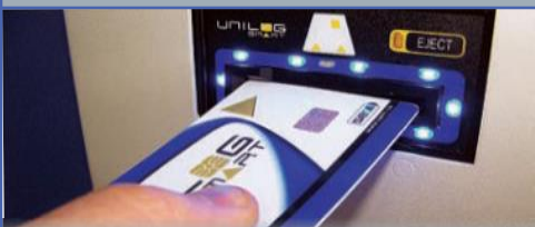
U-SMART CARD READER